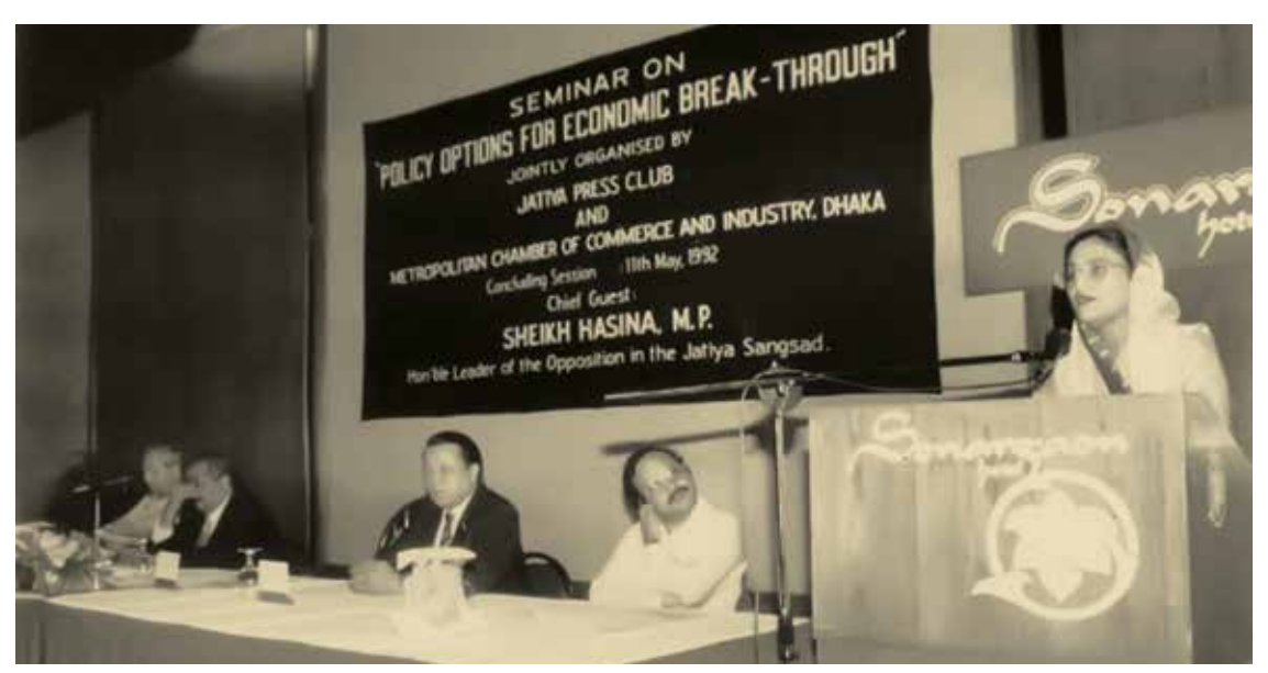
Sheikh Hasina, MP, Hon'ble Leader of the Opposition and President of Bangladesh Awami League addressing the national seminar on "Policy Options for Economic Breakthrough" on 11 May, 1992

addressed by the Finance Minister and the Minister of Planning. The Leader of the Opposition joined the closing ceremony and a large number of MPs, diplomats, journalists, economic and social thinkers, and political and trade union leaders participated in the discussions.<sup>50</sup>