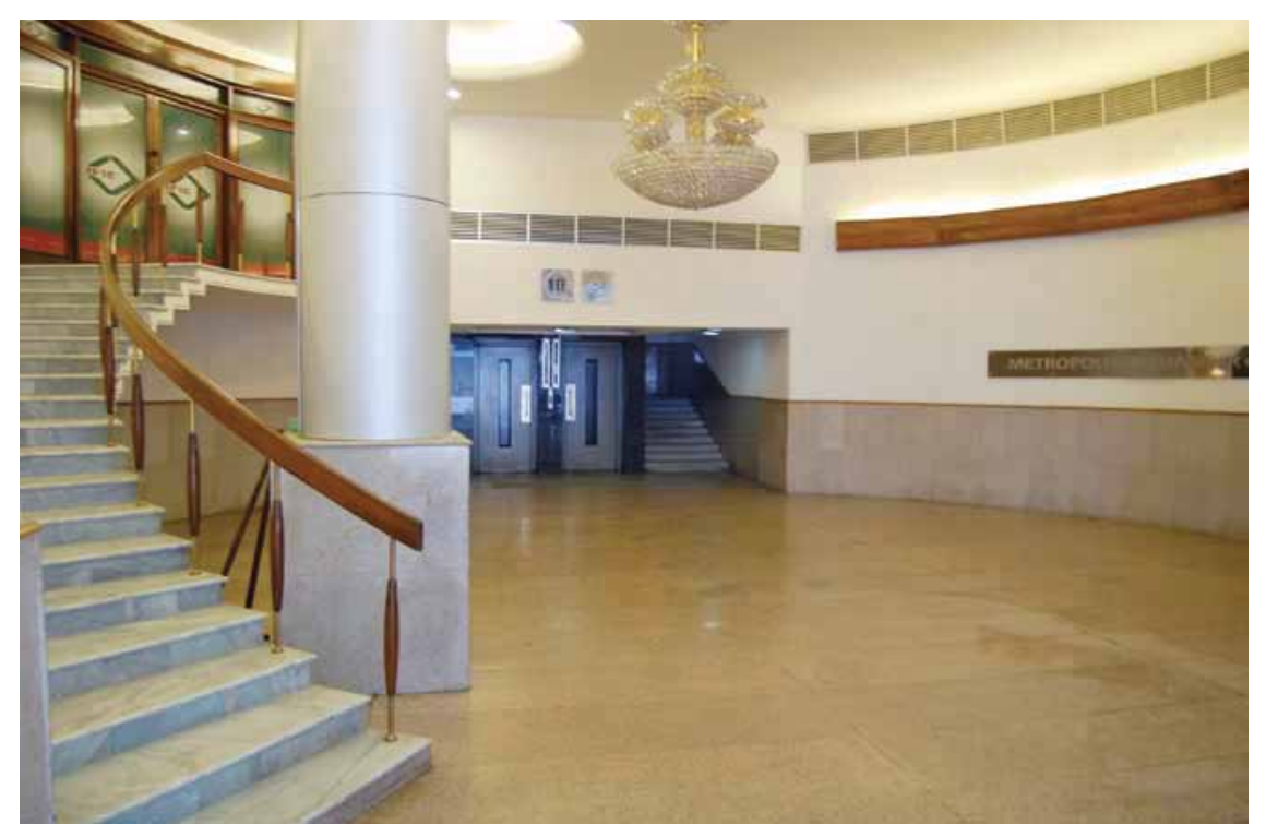
The foyer of the Chamber Building

The Chamber constructed more floors and the building has remained fully tenanted from 1967. In 1988, two new floors were extended. It was decided that the two side wings of the 4th and 5th floors would be used for the Chamber's Conference Hall, Library and other purposes. 101 This building is now known as the 'Chamber Building' and is a landmark in Motijheel, Dhaka.