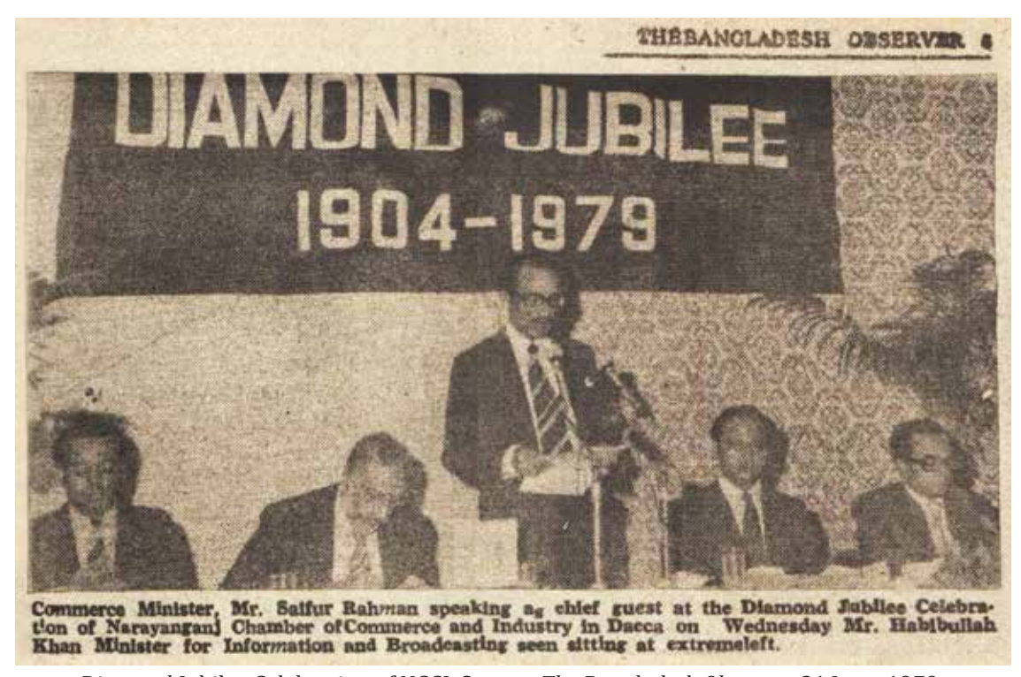
Diamond Jubilee Celebration of NCCI.

The Chamber arranged a seminar on the "Two Year Plan" that was held at the Chamber Building on 20 June 1978. The Planning Commission, Government of Bangladesh, requested the Chamber to arrange the seminar. Three papers on the 'Two Year Plan Private Sector', 'Some Aspects of Financing and Domestic Resources Publication' and 'Creation of Job Opportunities and too much Dependence on on-going Projects' were presented by the Chamber members. In the meeting a number of important recommendations were made, including creation of a separate cell for formulation of policy measures to help promote private sector industries. The Planning Commission sent some of these recommendations to the Ministry of Industries for its comments.