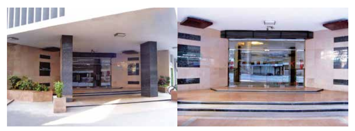
Entrance of the Chamber Building

The Chamber constructed more floors and the building has remained fully tenanted from 1967. In 1988, two new floors were extended. It was decided that the two side wings of the 4th and 5th floors would be used for the Chamber's Conference Hall, Library and other purposes. 101 This building is now known as the 'Chamber Building' and is a landmark in Motijheel, Dhaka.