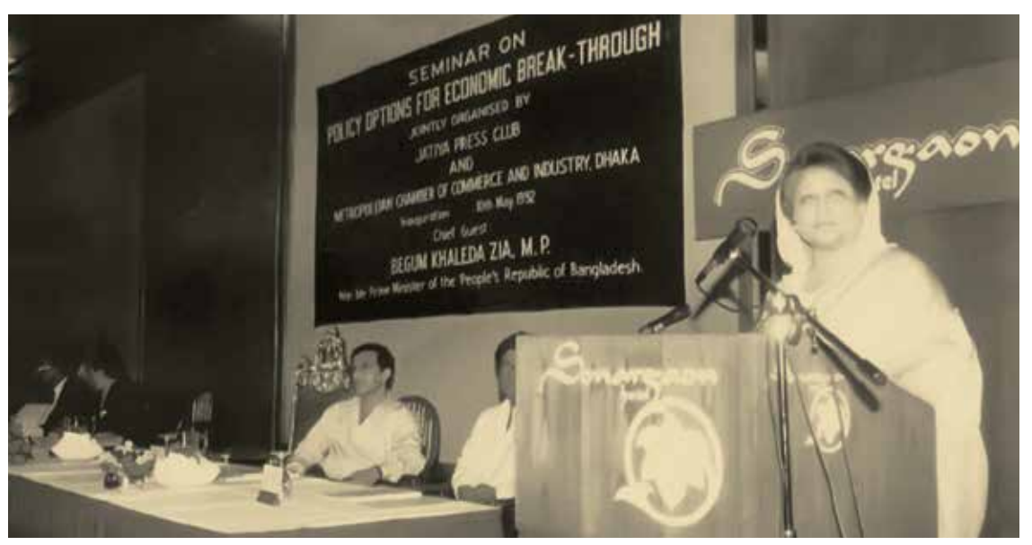
Begum Khaleda Zia, MP, Hon'ble Prime Minister, inaugurating the national seminar on 'Policy Options for Economic Breakthrough' on 10 May, 1992.