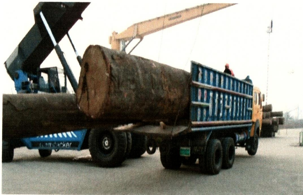
Wooden Log Handling