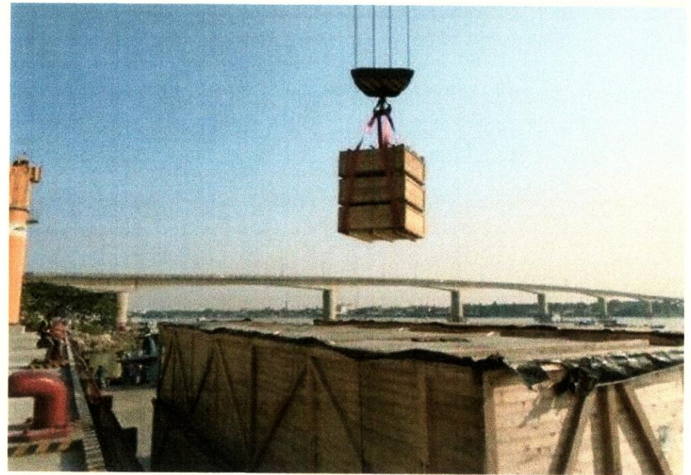
Project Cargo Handling