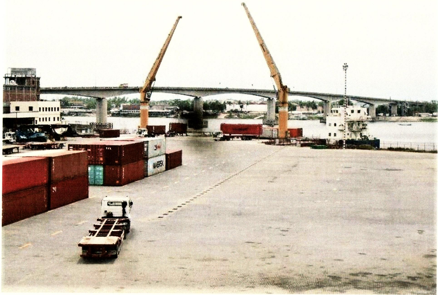
Present view of SAPL IWCT