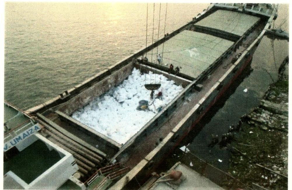
Soda Ash Handling